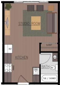
TYPICAL STUDIO UNIT FLOORPLAN 384 sq. ft.