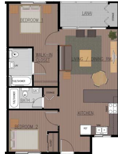
TYPICAL (2) BEDROOM UNIT FLOORPLAN 936 sq. ft.