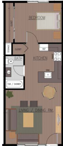
TYPICAL (1) BEDROOM UNIT FLOORPLAN 640 sq. ft.